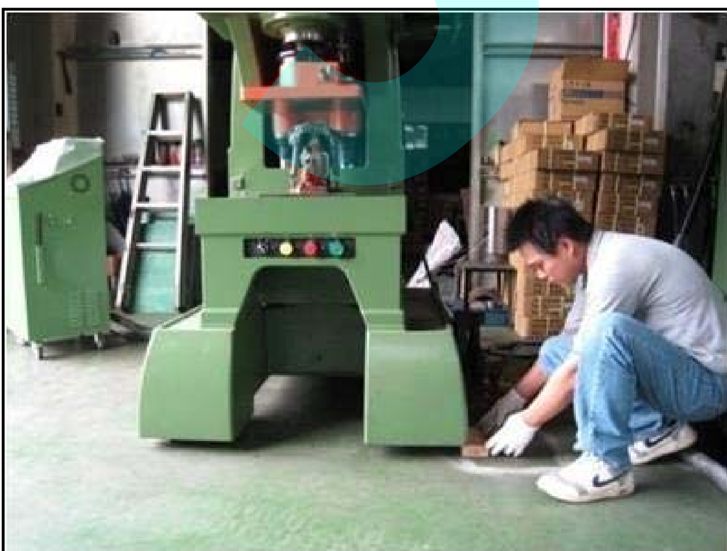
圖3)放置臨時木台110~120mm高度。 Fig 3) Place the wooden panel to 110~120mm.