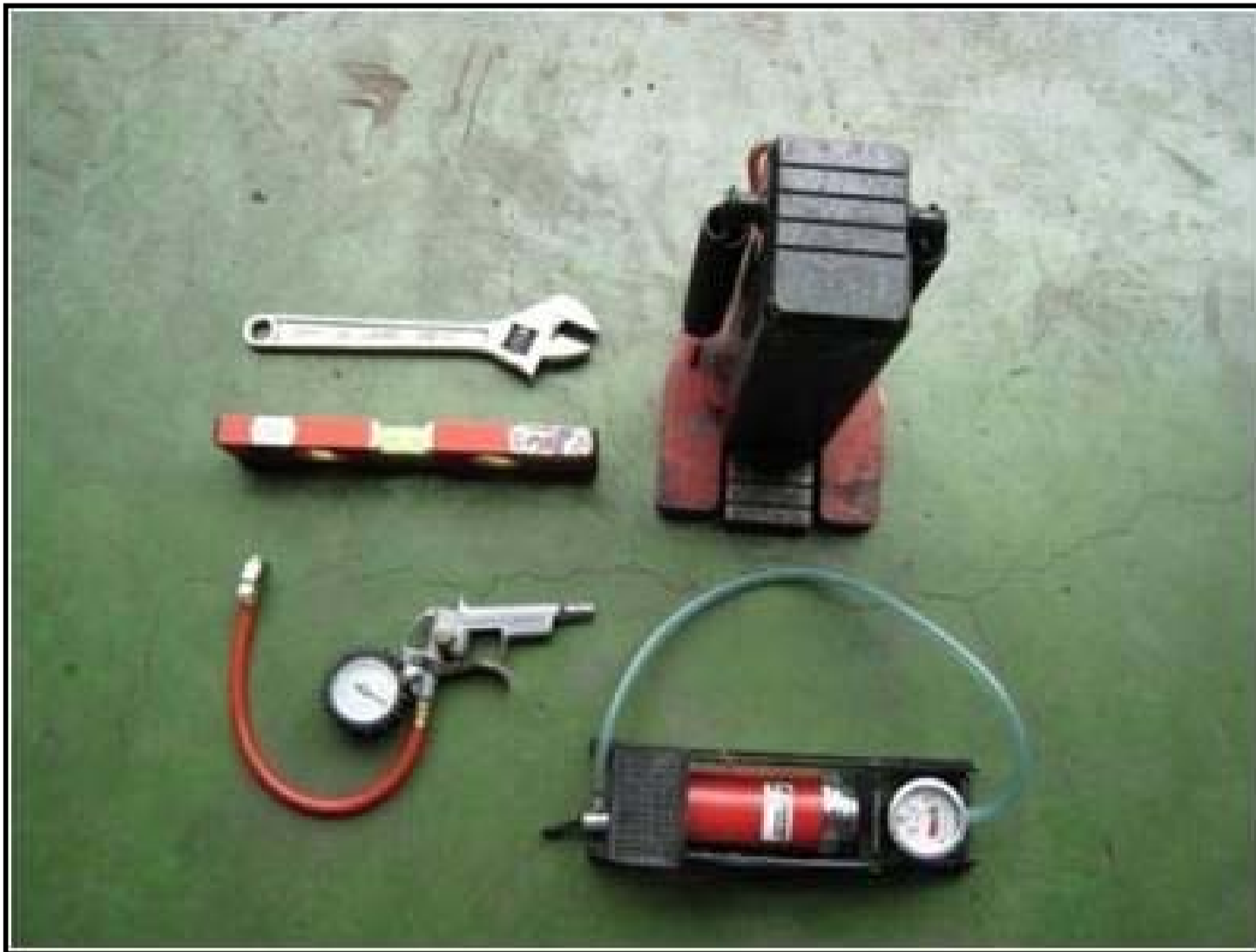
圖1)需要工具：爪式千斤頂、水平尺、扳手、壓力錶、打氣筒。 Fig 1) Required tools: claw jack, level bar, open wrench, pressure gauge, and air pump.