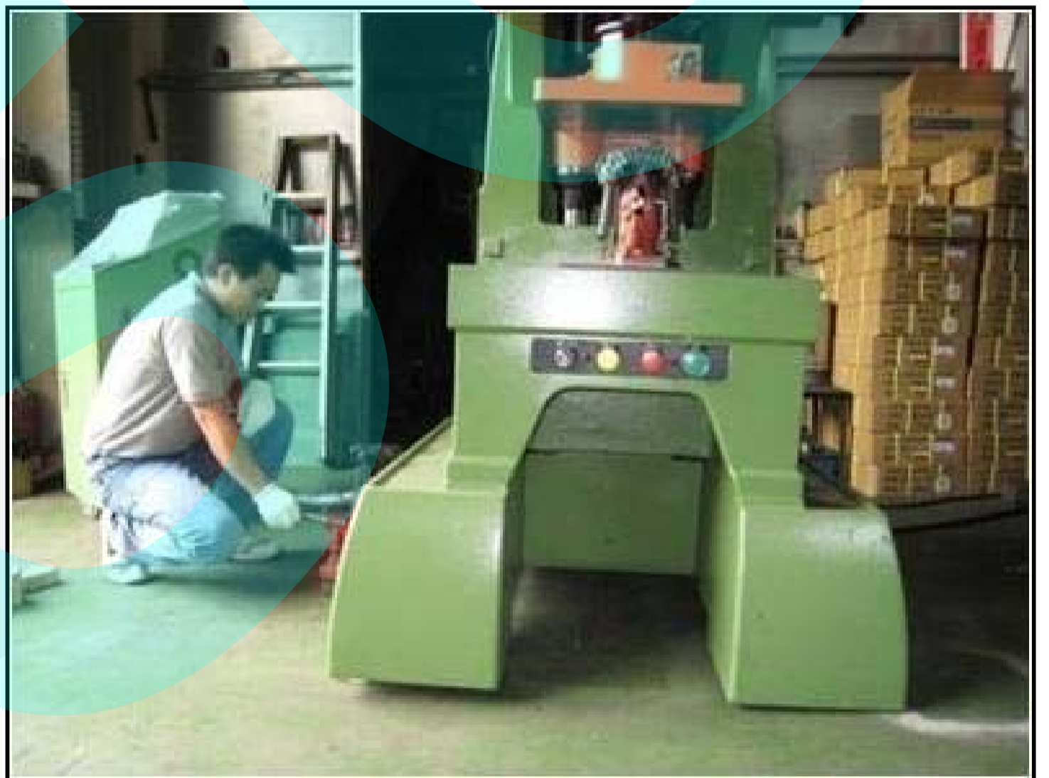
圖2)使用爪式千斤頂緩慢將設備頂起。 Fig 2) Elevate the equipment with claw jack gradually.