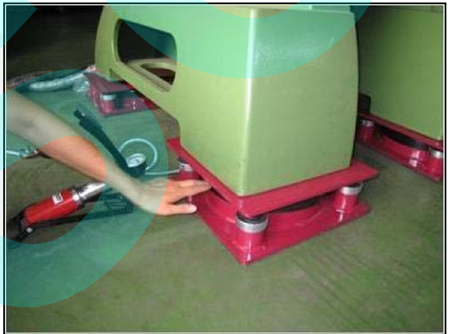
Fig 5) Inflate with air pump. Maximum inner pressure is 4.5\text{kg}/\text{cm}^2 = 0.44\text{Mpa} and the height of maximum loading is 120\text{mm} . Take out wooden panel after inflation.

圖5)使用打氣筒打氣至避震器，最大使用內壓為 4.5\text{kg}/\text{cm}^2 = 0.44\text{Mpa} ；最大荷重時標準高度為 120\text{mm} 此時充氣完成後，即可取出臨時木台。