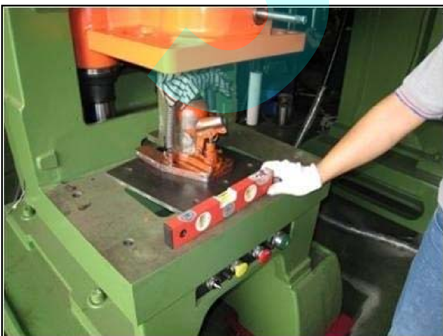
圖6)利用水平尺檢視設備水平。 Fig 6) Check the level with level bar.