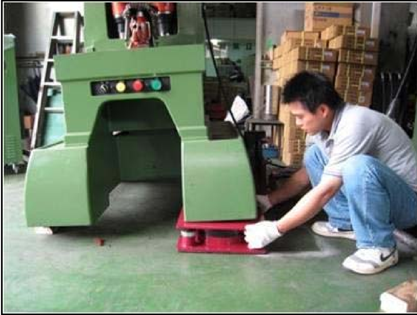
圖4)將避震器置入安裝處，並以螺栓固定之。 Fig 4) Install the mounts on the equipment in order and lock them.

圖5)使用打氣筒打氣至避震器，最大使用內壓為 4.5\text{kg}/\text{cm}^2 = 0.44\text{Mpa} ；最大荷重時標準高度為 120\text{mm} 此時充氣完成後，即可取出臨時木台。